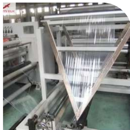
Center Fold, Lay Flat & Single Layer Shrink Rolls