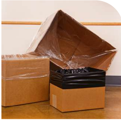
Box Liners & Inner Poly Covers