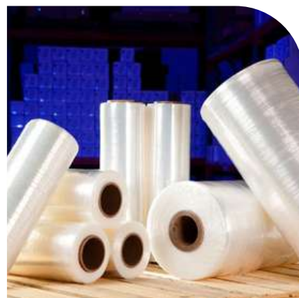
Suitable for Multipack, Pallet & Industrial Wrapping Applications