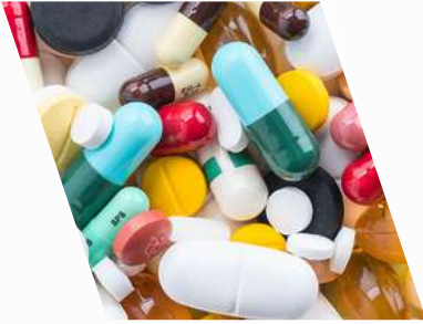
Pharmaceutical & Healthcare