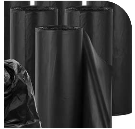
Heavy Duty Industrial Bags