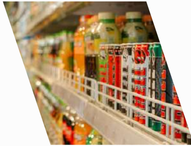
FMCG & Consumer Goods