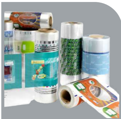
Printed Shrink Films (as per customer requirement)