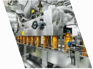
Food & Beverage Industry