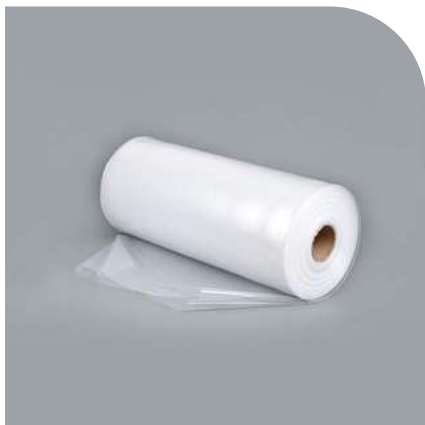
LDP & LLDP Shrink Films (Transparent/Natural)