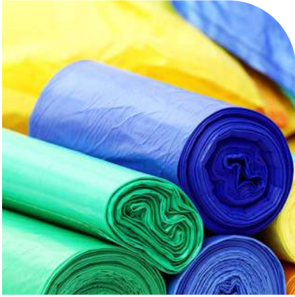
LDP/ LLDPE/ HDPE Bags