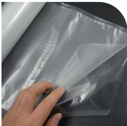
Custom-Sized LDP/LLDP Shrink Bags