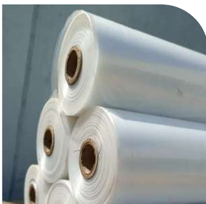
High Clarity & Superior Shrink Ratio